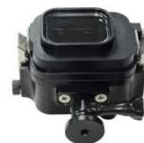
HERO-2. 3 housing tripod adaptor