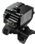
HERO-2. 3 housing hand grip-3