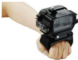
HERO-2. 3 housing hand grip-1